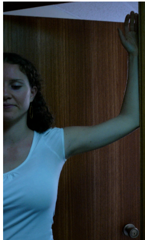
B. 120 degrees