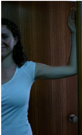
A. 90 degrees